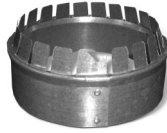
RX10 Start Collar no crimp